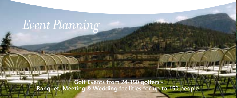
Golf Events from 24-150 golfers - Banquet, Meeting & Wedding facilities for up to 150 people

Step up to Gallagher's Canyon, an elevating golf experience.