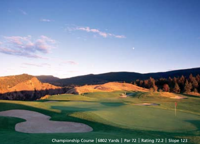
Championship Course | 6802 Yards | Par 72 | Rating 72.2 | Slope 123

Framed by forested mountains and rocky bluffs beneath clear blue northern skies, Gallagher's Canyon offers the quintessential Okanagan golf experience: rugged yet refined.