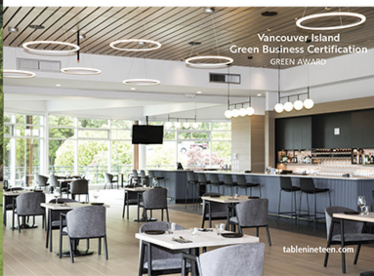
Vancouver Island Green Business Certification GREEN AWARD

We are proud to have attained the ultimate "GREEN" level certification from the Vancouver Island Green Business Collective. Some of our efforts to date include composting, recycling, water and electricity conservation, community volunteering and installing a bicycle rack to encourage more guests and team to ride their bikes.