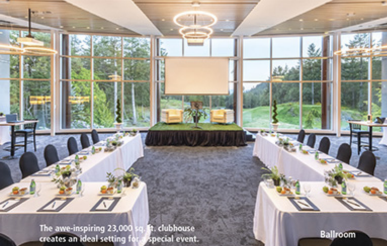
The awe-inspiring 23,000 sq. ft. clubhouse creates an ideal setting for a special event.