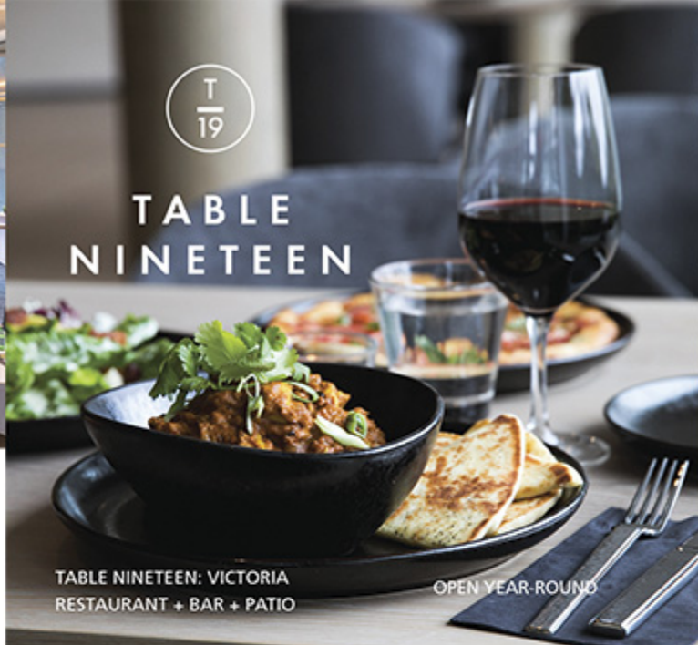
TABLE NINETEEN: VICTORIA RESTAURANT + BAR + PATIO