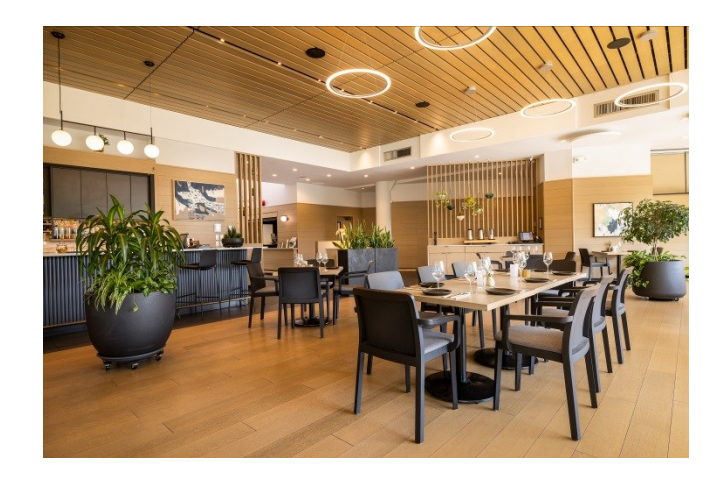
TABLE NINETEEN BAR ROOM

*approx. size: 1,300 sq ft, maximum capacity 85