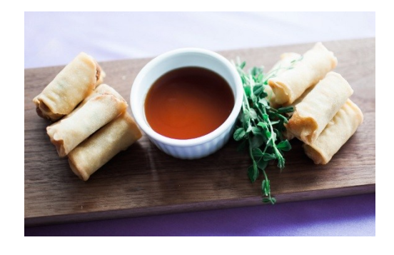
Price is per dozen, with a minimum of 3 dozen per selection. Your choice of having selections served or placed!