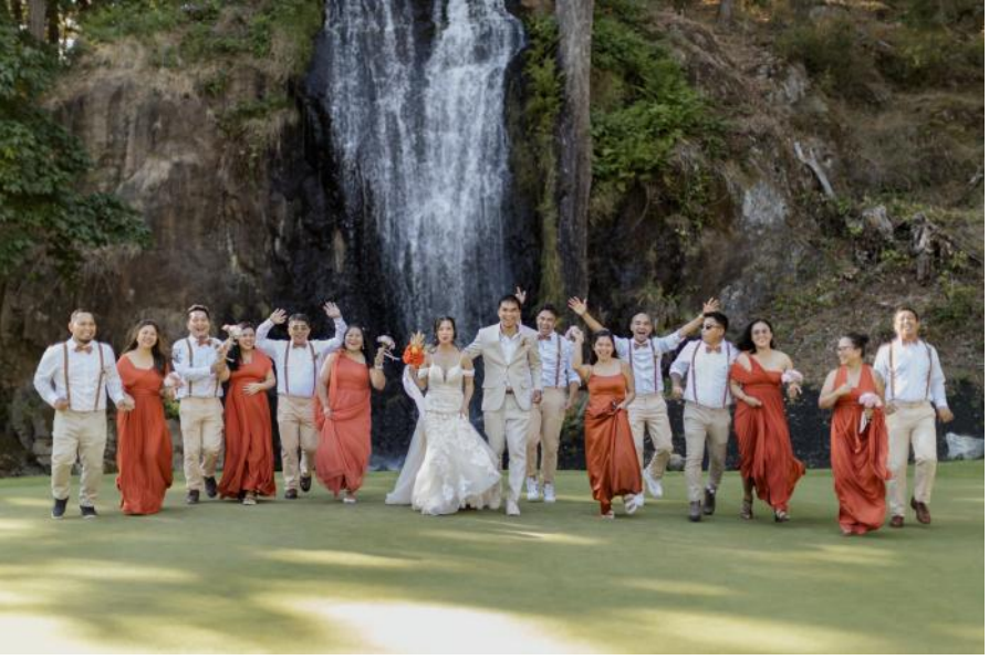
"Just wanted to say a final thank you. You and your banquet captain were both so amazing! We are so lucky we were able to have our wedding at OV. Would never be able to thank you enough for all your help and guidance. All future couples are so lucky to have you and the whole team!" K&N

"We just wanted to thank you SOOO much for everything you did to make our wedding day run smoothly. Olympic View was the perfect location. We are so happy we chose it and have nothing but good things to say about it. The scenery, the staff, the food, everything!! Our guests are still talking about the beautiful location and delicious food! Thank you for always being there to answer questions and for being so friendly! You were wonderful to work with and incredible at your job! Thank you so much!!" K & M